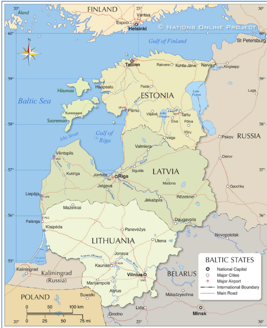
FIGURE 1: BALTIC REGION AND THE SUWALKI GAP