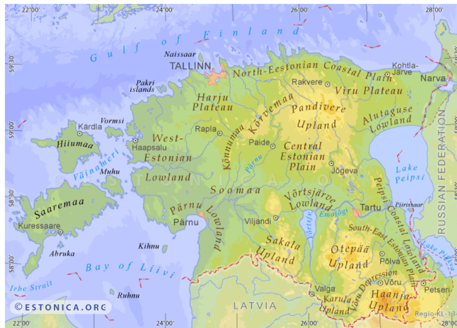
FIGURE 2: ESTONIAN NATURAL FEATURES